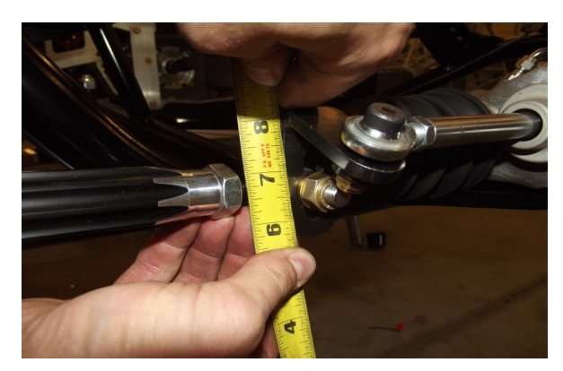
(RS bump steer at rack)

14" tube LS- 17" center to center standard spindle 13" tube LS- 16 3/8" center to center ackerman spindle