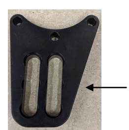
Left lower rod Middle back hole neutral