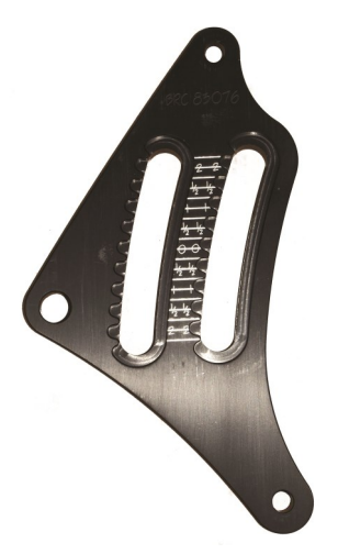
Walk up bracket