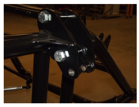
RF 1" out mount

I. RF shock mount—correct upper mount must be installed for running standard (#41190) or 1" out (#41191) to attain proper shock angle and travel