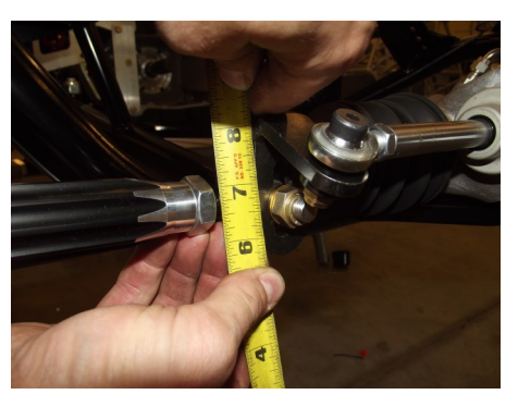
(RS bump steer at rack)